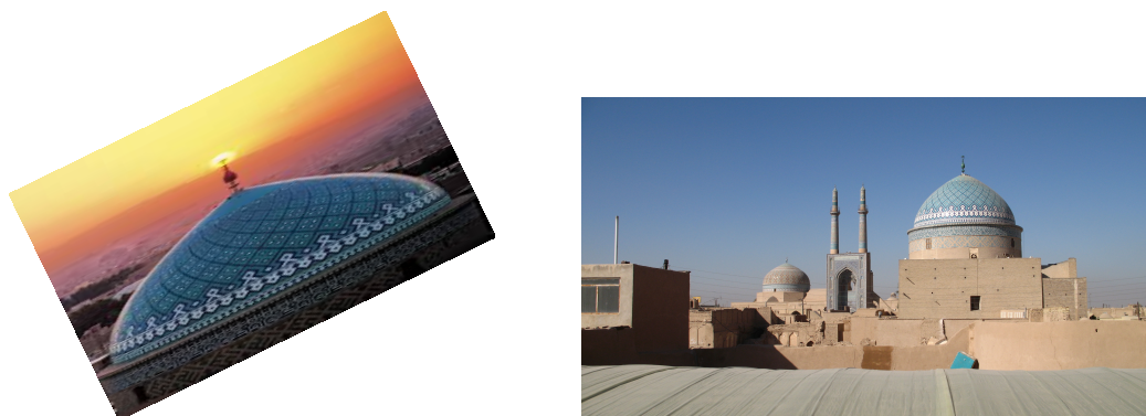
Figure 4.1: This is caption of the figure.